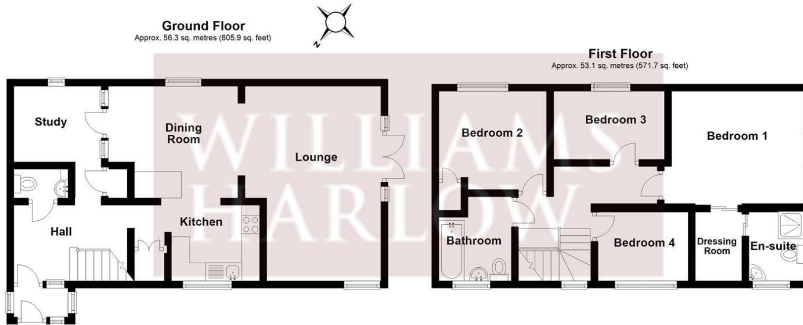
Ground Floor Approx. 56.3 sq. metres (605.9 sq. feet)

Whilst we endeavour to make our sales particulars accurate and reliable, however, they do not constitute or form part of an offer or any contract and none is to be relied upon as statements of representation or fact. The services, systems and appliances listed in this specification have not been tested by us and no guarantees as to their operating ability or efficiency are given. All measurements have been taken as guide to prospective buyers only, and are not precise. If you require clarification or further information on any points, please contact us, especially if you are travelling some distance to view.